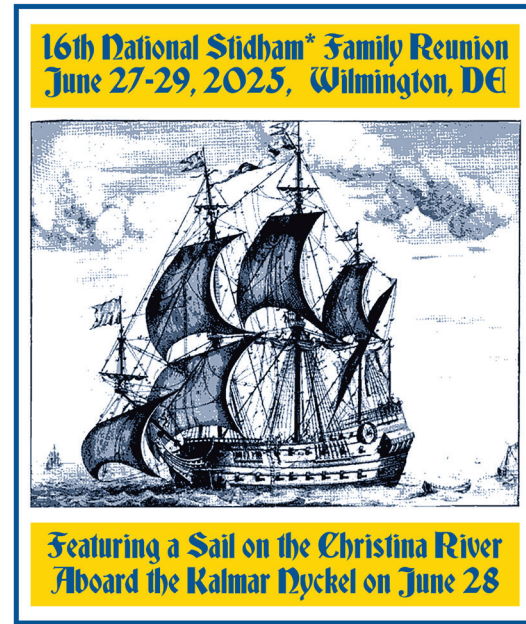
Closeup of back of shirt