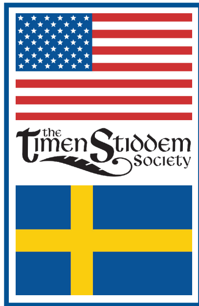
Closeup of front of shirt