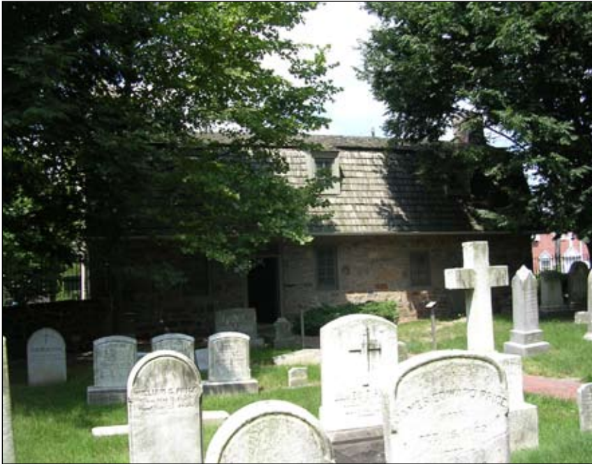
The Hendrickson House, originally built in 1690, was moved to the church grounds in 1958 and restored. Today it serves as a museum of early colonial Swedish life, which includes a gift shop of New Sweden collectables. See number 3 on map page 9.